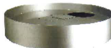
Duo Well Ring D60

The water tap is provided with a 3-way self-emptying sliding valve. When the water tap is not in use, the valve and riser pipe are emptied of water that might otherwise freeze. The water tap and thus the valve and riser pipe are frost-proof as long as the water supply line for the tap does not freeze.